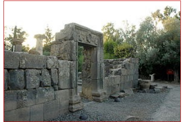
Entrance to ancient Katzrin synagogue

The ancient Jewish farming village of Katzrin was built around a spring which still flows. Although there were standing ruins on the sites, archaeological excavations have revealed even more ancient buildings.