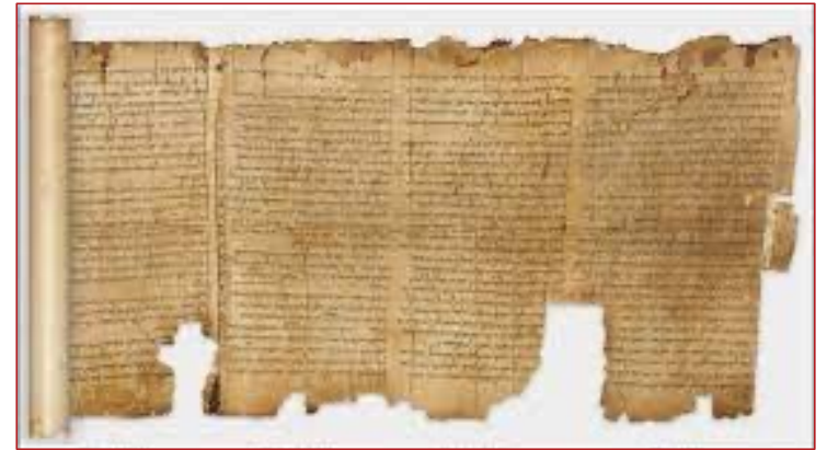
Entire Book of Isaiah found in Qumran caves