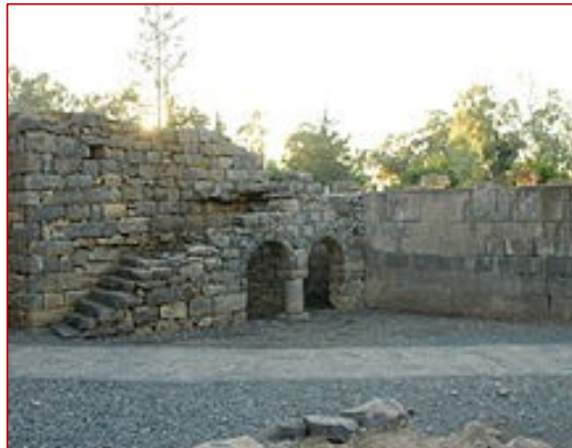
Reconstructed arches in a section of the ancient village

Ancient Katzrin is a restored Byzantine period village in the central Golan area. This unique archaeological park provides a complete picture of the everyday life in a typical Jewish village at these times, also known as the Talmudic period. The park is located near the modern city of Katzrin - the main Jewish city of the Golan.